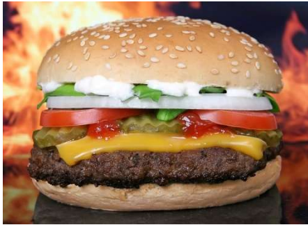
Hamburger: 3086 grams CO2