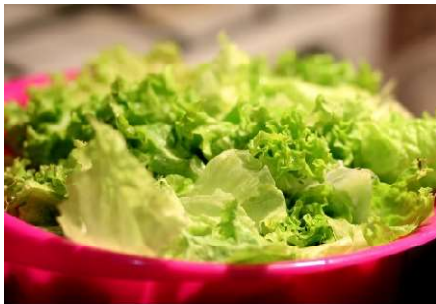
Salad: 70 grams CO2