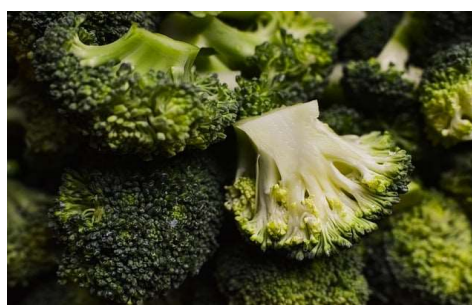
Broccoli: 134 grams CO2