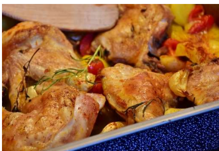
Chicken: 1087 grams CO2