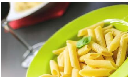
Pasta: 152 grams CO2