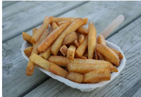
French fries: 615 grams CO2