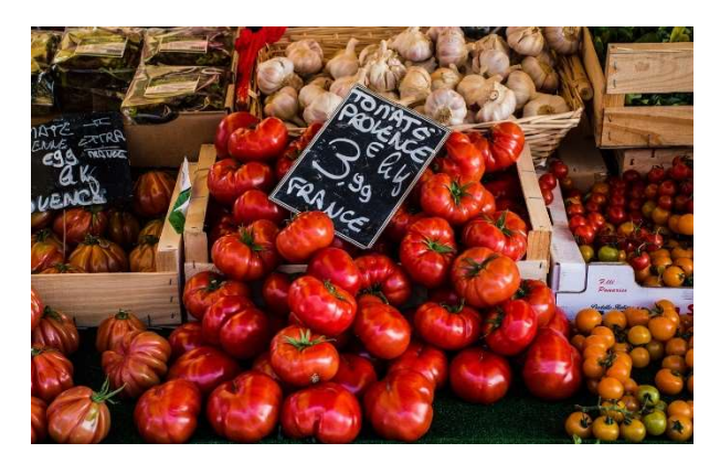
Appendix 1: Pictures and photos for activation