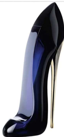
Carolina Herrera - Good Girl 30 ml Eau de Parfum 4,7 ★★★★★ 34.188 Eau de parfum · Spray

63,04 € 630,40 € / 1 l parfumdreams.IT Consegna gratuita