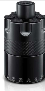
Azzaro The Most Wanted Eau de Parfum Intense 100 ml 4,8 ★★★★★ 5.514 Eau de parfum · Spray

SOME EXAMPLES FOR THE PHASE 3 (EVALUATE THE PRODUCT)