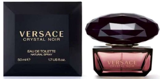
Versace - Crystal Noir Eau de Toilette 50 ml