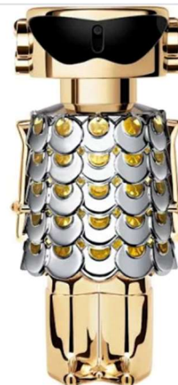
Paco Rabanne Eau de Parfum Fame 80ml 4,7 ★★★★★ 9.726 Eau de parfum · Spray