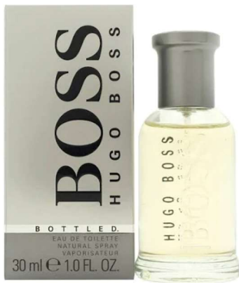
Hugo Boss Bottled Eau de Toilette 30 ml | Boss